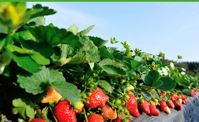
Strawberry plot, Jalilabad

One of the famous communities in Jalilabad is "Fadak" community, formed under Goytepe Baghi LLC in Goytepe city, unites 350 strawberry producers. Led by Miragha Hasanov, the community provides members with supplier credits for strawberry cultivation. Miragha also offers affordable cellophane mulches and purchases the members' produce, selling it in Baku and exporting it to Russia.