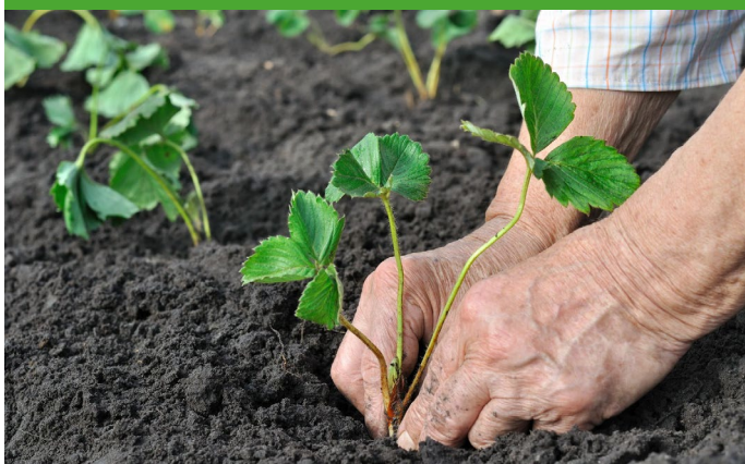
Seedling plantation, Jalilabad

To address some of these issues, the “EU4Lankaran” project provides significant support in improving the strawberry value chain in Jalilabad. This includes initiatives to enhance branding and marketing strategies, which are crucial for searching new markets beyond Russia. Additionally, the project aims to increase the capacity of local facilities in district to get a HACCP certification, thereby enabling the export of their products to other markets. The project also supports the development of bankable projects to introduce new technologies like Individual Quick Frozen (IQF) and Frigo Seedlings into the strawberry sectors. Such investments are essential for reducing post-harvest losses and for adding value to the raw strawberry product, thereby increasing the income of local producers.